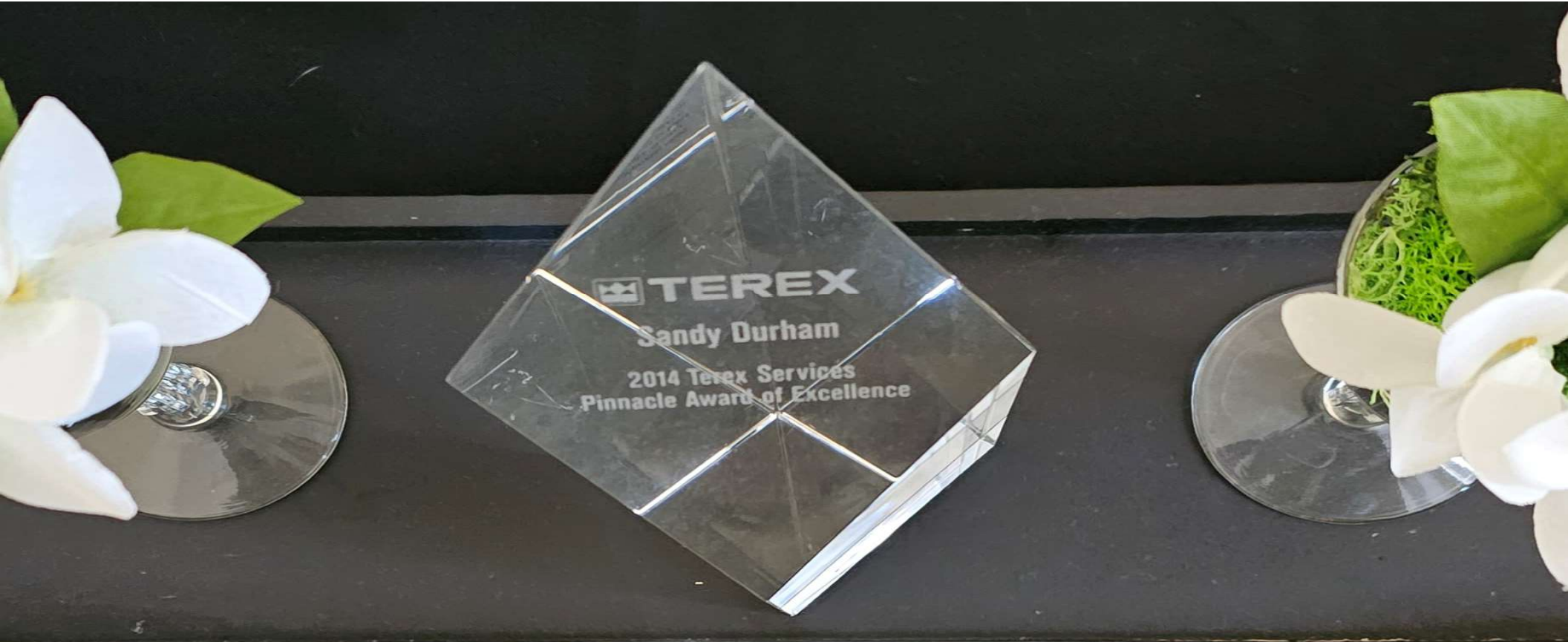
Terex 2014 pinnacle aware of excellence